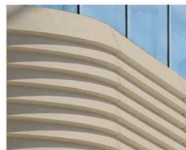
Stone colour plinth