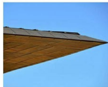
Brass/bronze colour balcony/roof blade

Notes: All drawings are subject to Planning and Building Control consent. The details shown are for design intent purposes only and are subject to further design development with suppliers and sub-contractors Proposals subject to consultation and approval from Local Authority Building Control or an Approved Inspector All setting out dimensions should be checked on-site prior to construction and any discrepancies and/or omissions should be reported to the Architect immediately