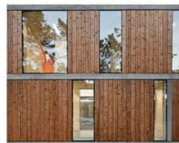
Timber effect cladding with shadow gap