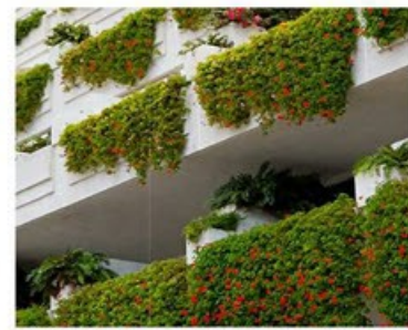
Planted edge to stepped terrace