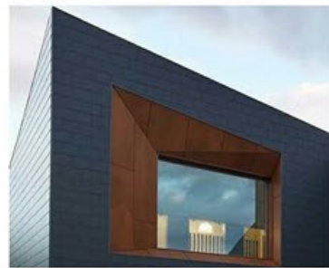
Dark grey cladding with timber effect panels