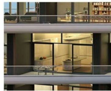
Recessed balcony & glazed balustrade