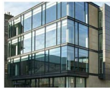
Glazed facade with expressed floor edge