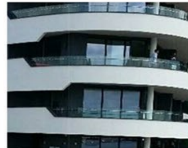
White render balcony parapets